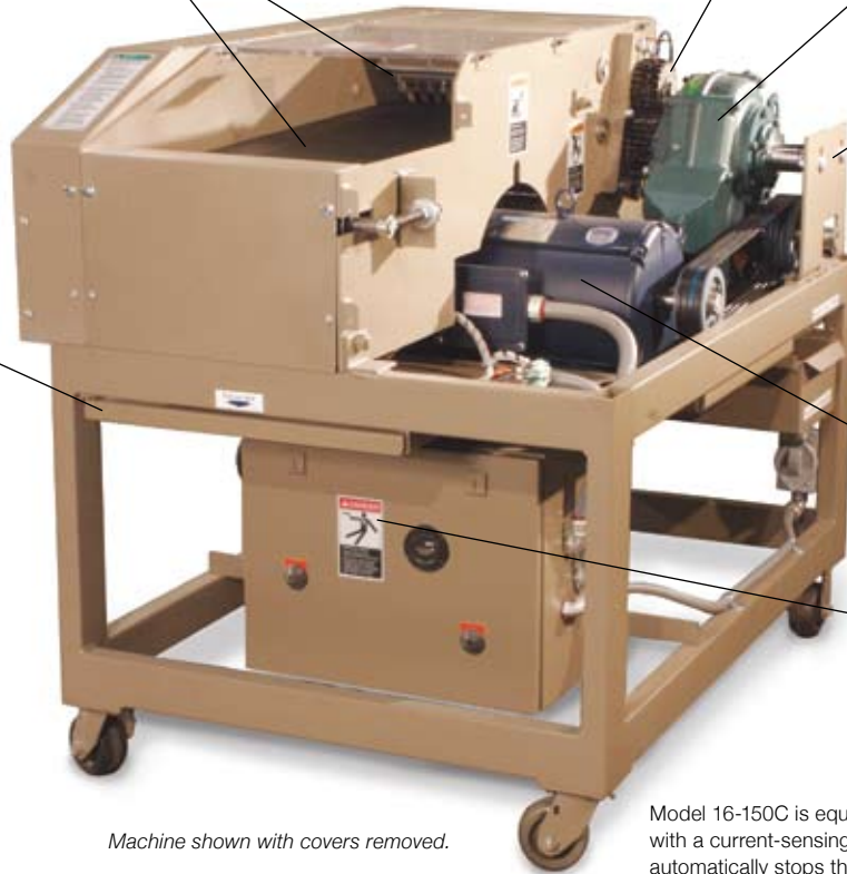
Machine shown with covers removed.

International symbol-coded safety labels are affixed to the machine to ensure operator safety awareness.