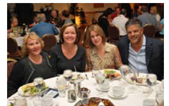
'08 PRISM conference, Alaska